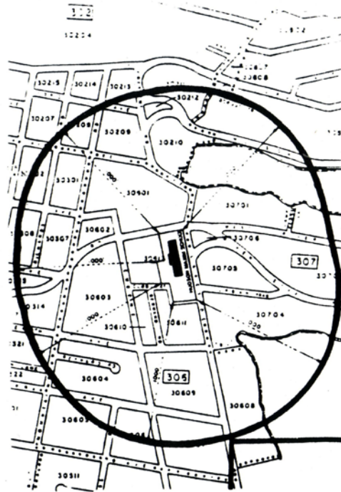
MAP OF DRUG ENFORCEMENT AREA